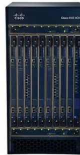
Cisco TelePresence MSE 8000 chassis

The Cisco TelePresence™ portfolio creates an immersive, face-to-face experience over the network—empowering you to collaborate with others like never before. Through a powerful combination of technologies and design that allows you and remote participants to feel as if you are all in the same room, the Cisco TelePresence portfolio has the potential to provide great productivity benefits and transform your business. Many organizations are already using it to control costs, make decisions faster, improve customer intimacy, scale scarce resources, and speed products to market.