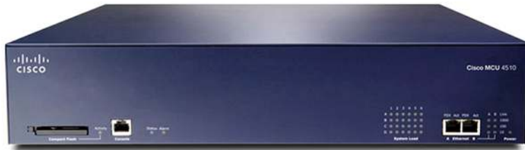
Figure 1. Cisco TelePresence MCU 4500 Series