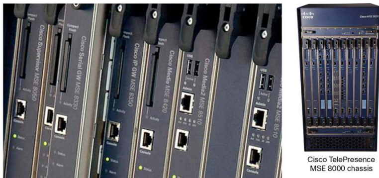
Cisco TelePresence MSE 8000 chassis