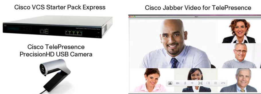
Figure 1. Cisco TelePresence Video Communication Server Starter Pack Express Bundle

The Cisco TelePresence ® Video Communication Server (VCS) Starter Pack Express is a feature-packed on-premises solution targeted to small and medium-sized businesses (SMBs) that are deploying a telepresence system for the first time. It allows these businesses to experience high-quality, enterprise-grade videoconferencing without spending a fortune on specialized equipment while providing a platform that allows for further infrastructure expansion (Figure 1).