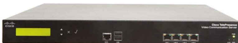
Figure 1. Cisco TelePresence Video Communication Server Appliance

You can deploy the Cisco VCS as the Cisco TelePresence Video Communication Server Control (Cisco VCS Control) for use within an enterprise and as the Cisco TelePresence Video Communication Server Expressway (Cisco VCS Expressway) for business-to-business and remote and mobile worker external communication (Figure 2). An alternative solution, suited to small to medium-sized businesses (SMBs), is the Cisco VCS Starter Pack Express.