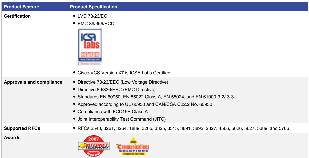
Table 3. Certification, Approvals, and Awards for Cisco VCS